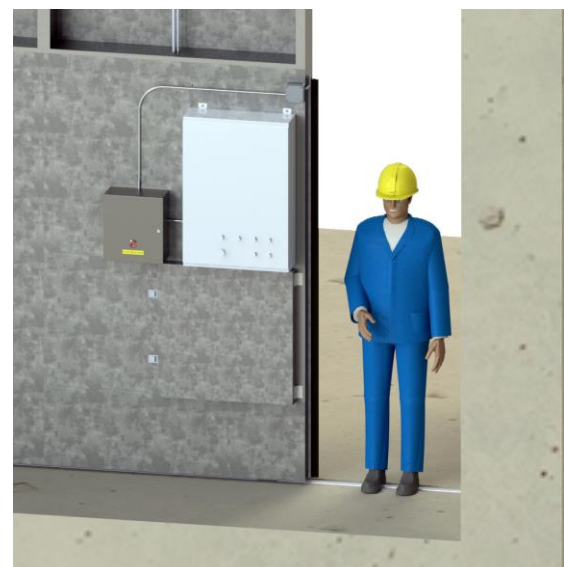
Safety Edge Retro-Fit System Layout, Elevation View Hangar Door Example